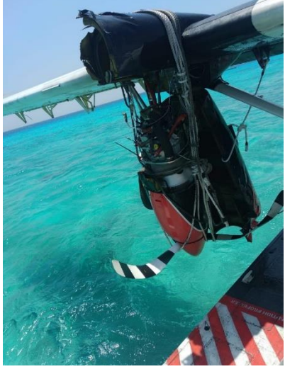
Figure 1: Aircraft engine detached from all three mounts after the accident

Descent began 15 mins prior to landing at Kuredhu, and the FO gave the briefing and descent checks were carried out. The FO requested the PIC to 'standby for the line' and when the Kuredhu was visible, the FO also infomed the PIC that this will be "Right base for north east bound landing". The FO reported seeing white caps and the waters were choppy but was confident of landing in such rough waters, as having done similar landings even the week before. The FO communicated the line to the PIC and stated "in case of goaround we will climb to 500 feet as per the SOP". The PIC advised the FO to keep the aircraft slightly t the left, closer to the reef, just on the lighter blue area, as it was believed that this area was relatively calmer. The FO reported that around