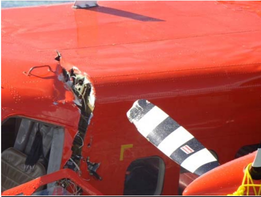
Fuselage cut made by propeller close to captain's seat