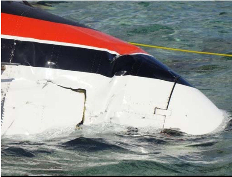
Fuselage area close to aircraft nose crushed