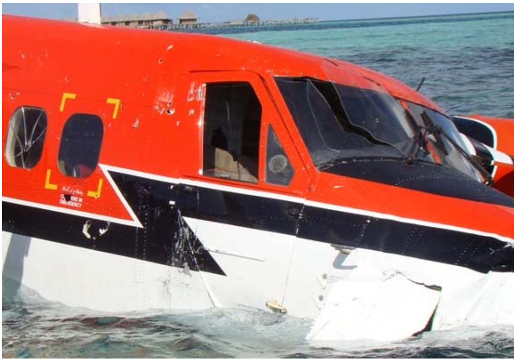
Co-pilot's windscreen broken