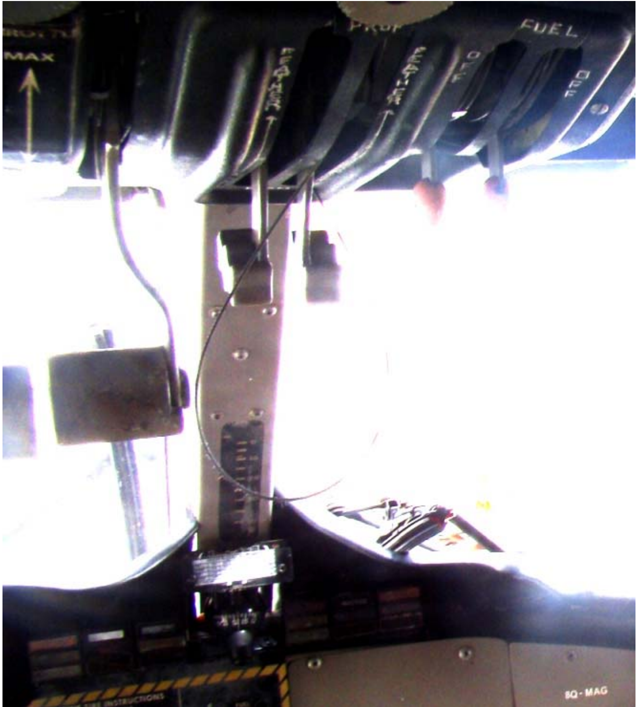
Flap angle indicator