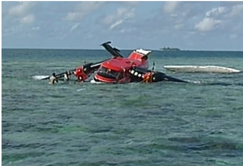
Left float behind the aircraft