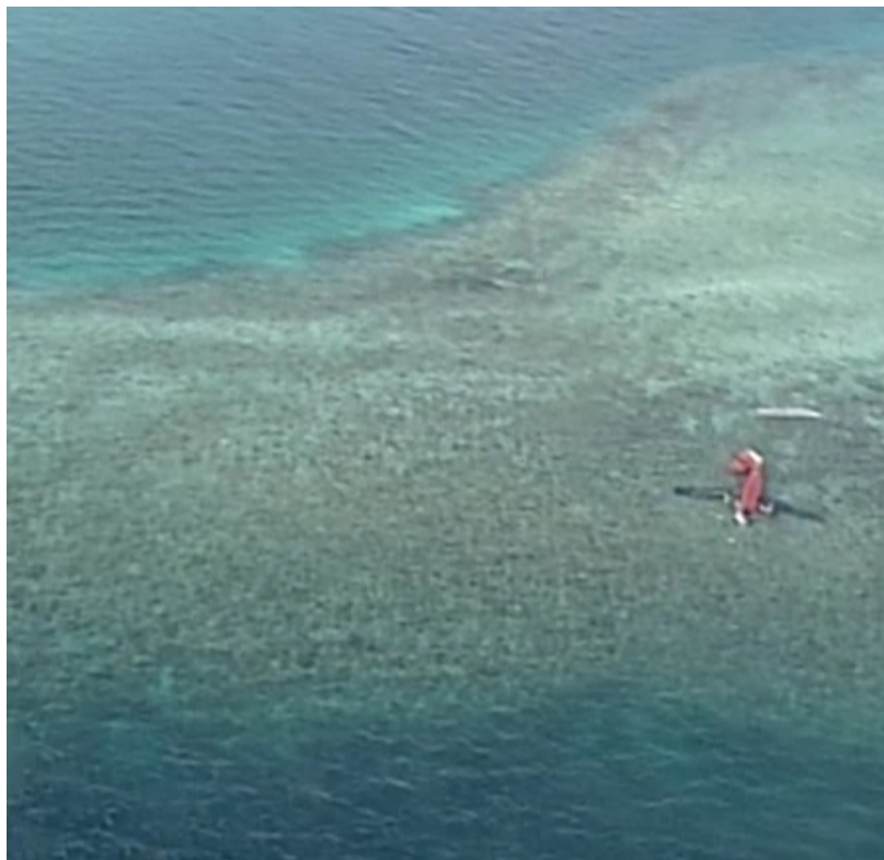
Aircraft on the reef