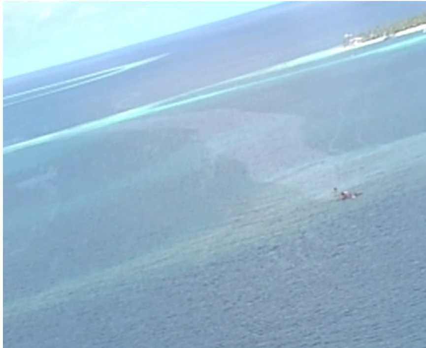
Aerial view of aircraft with Halaveli in the view