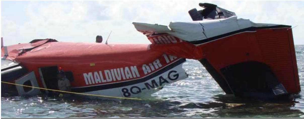
Aircraft tail twisted