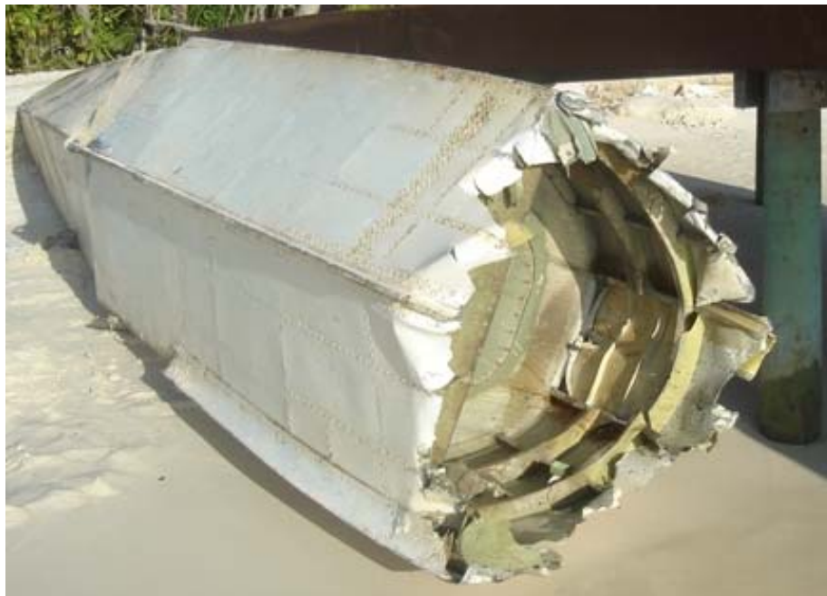
Right hand float on Halaveli beach