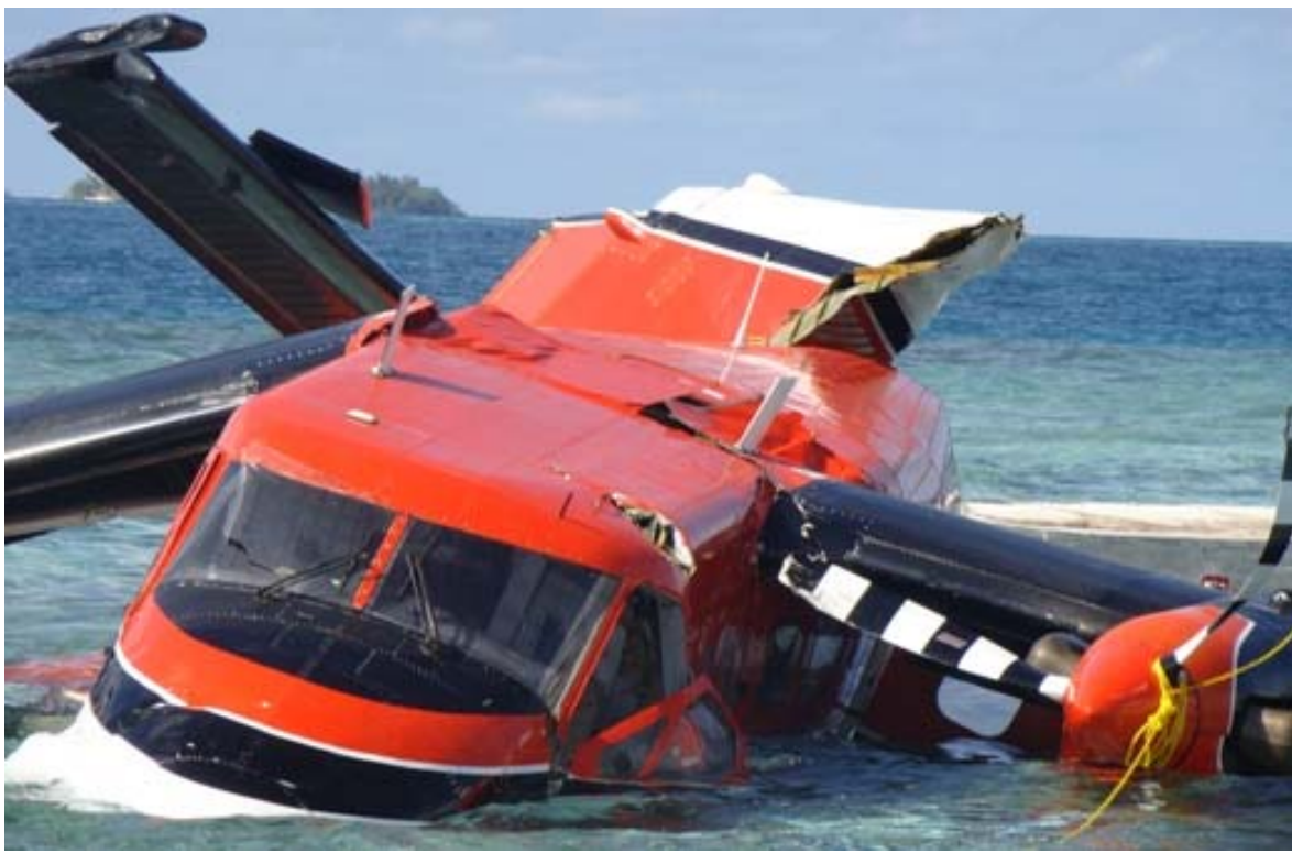
Wings broken at the roots