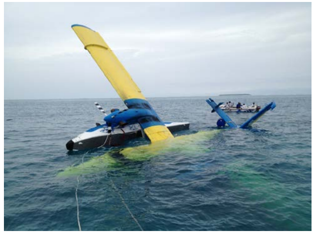
Image 4- Aircraft fuselage submerged