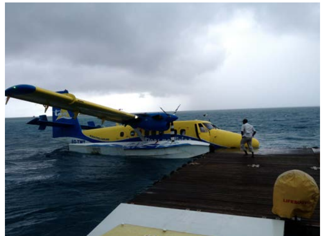
Image 2- Aircraft after the impact