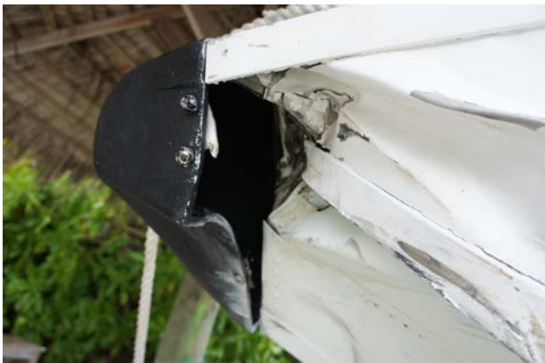
Image 5- LH Float damaged during the impact