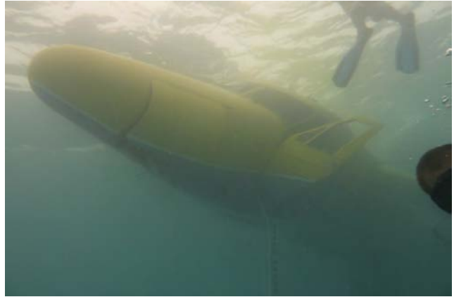
Image 8- Aircraft fuselage