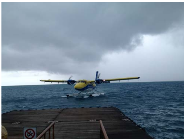
Image 1- photo taken during 1st attempt to dock