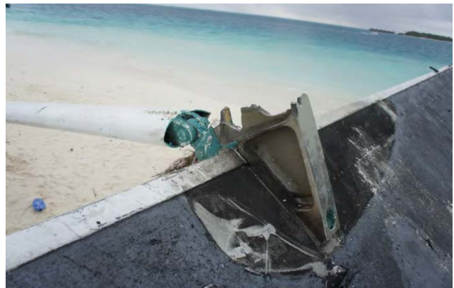
Image 6- LH Float attachments