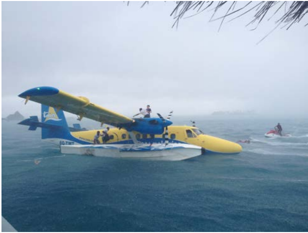
Image 3- Evacuating the passengers. Photo also shows the weather after impact